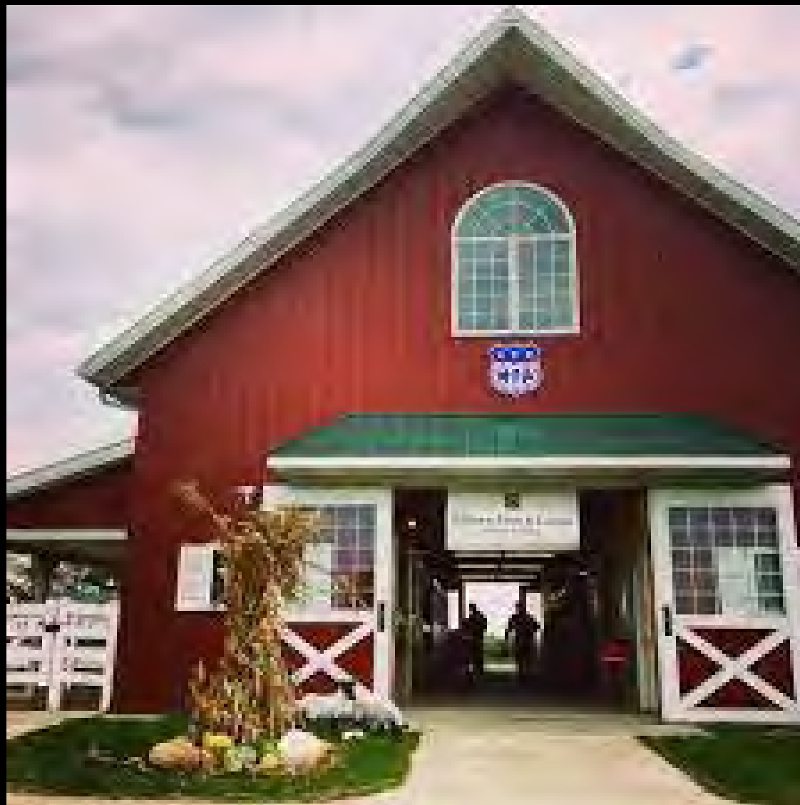
June 6 Breakfast Social at the Jefferson Farm and Garden Extension and education Center, 4800 New Haven Road