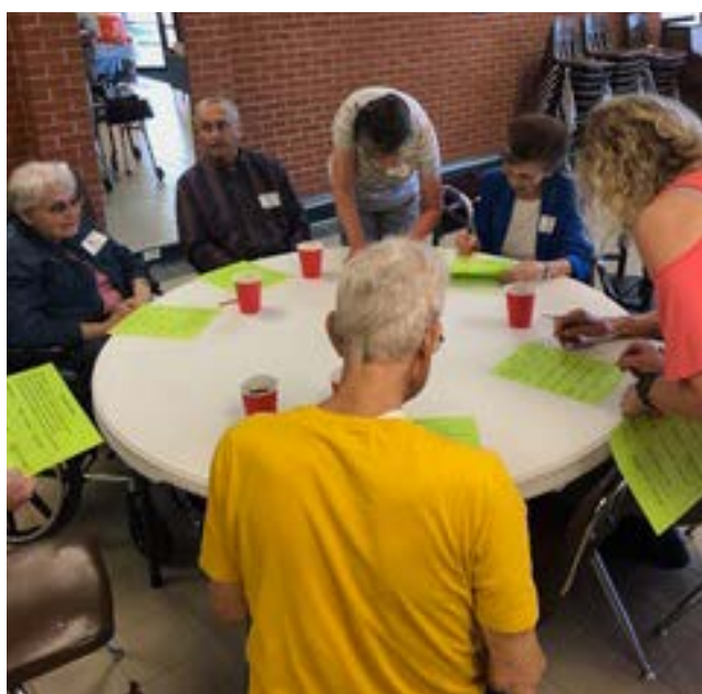
A friendly bit of competition engages MURA members.